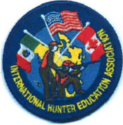
IHEA 3-Flag Patch Price $1.00