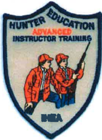
IHEA Advanced Instructor Training Patch

Recognizes Hunter Education Instructor graduates of advanced training. Price $1.00